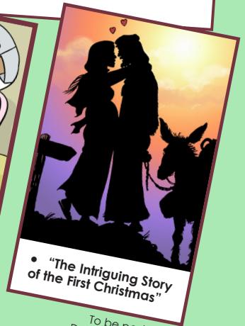
• "The Intriguing Story of the First Christmas"