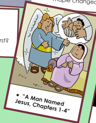
• "A Man Named Jesus, Chapters 1-4"